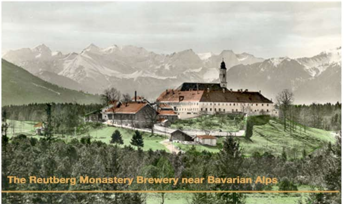
The Reutberg Monastery Brewery near Bavarian Alps